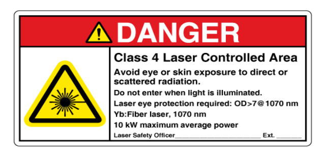
Figure 1c. Sample ANSI Z535.2 Compliant Class 4 Laser Controlled Area Danger Sign Format.